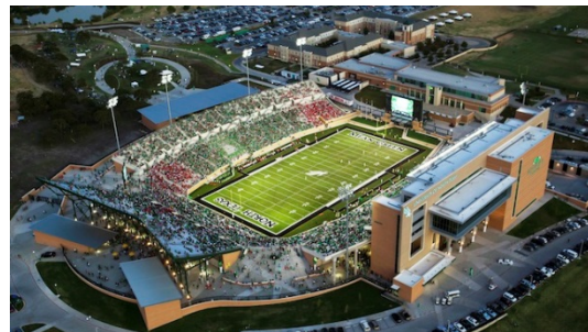
UNT Apogee Stadium , Denton, Texas – 140,000 GSF Tower, 31,000 seats, $79M, Received LEED V 2.2 Platinum Certification 2011, was the first Platinum Certified (new construction) football stadium in the country, Finalist World Stadium Awards Sustainable Division 2012