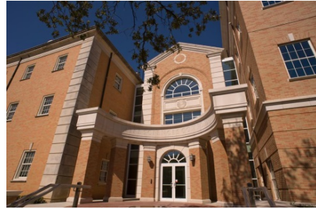
UNT Life Sciences Building , Denton, Texas – 87,000 GSF, $33M, Research Facility Received LEED V 2.2 Gold Certification 2010