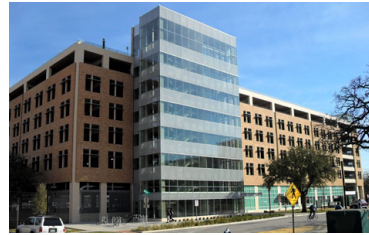
UNT Highland Street Parking Garage and Administration Offices, Denton, Texas – 950 vehicles, Satellite Chiller Plant & Parking Administration, Received LEED V 2.2 Gold Certification 2012