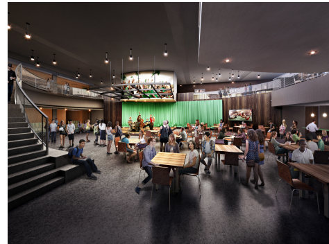
UNT University Union , Denton, Texas – Expansion and Renovation, $128M, Pending LEED Gold/Platinum V 2009, Opening Winter 2015