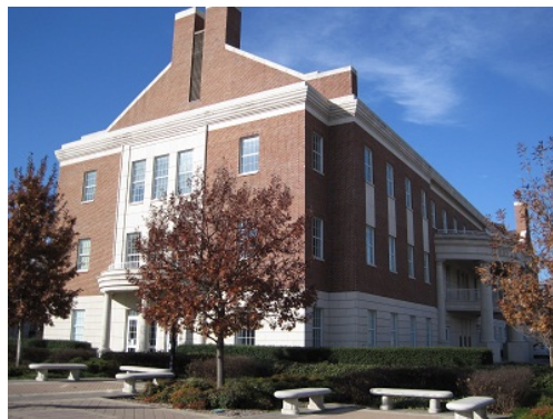
SMU Junkins Electrical Engineering - $13.8M, 2001-2002