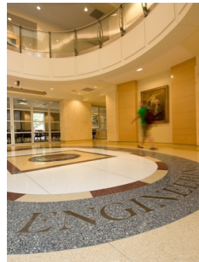
SMU Embrey Engineering - $16.1M, Received LEED V 2.1 Gold Certification, 2006