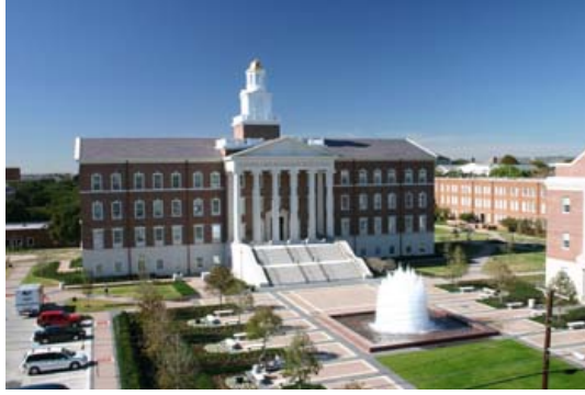
SMU Blanton Student Services - $13.3M, 2002-2003