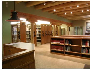
SMU Information Commons, SMU-IN-TAOS, Taos, New Mexico, $1.4M, 2004