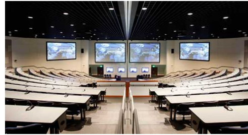
UNT Health Science Center, Medical Education and Training Building, Fort Worth, Texas – 112,500 GSF, $33M, Received LEED V 2.2 Gold Certification 2010