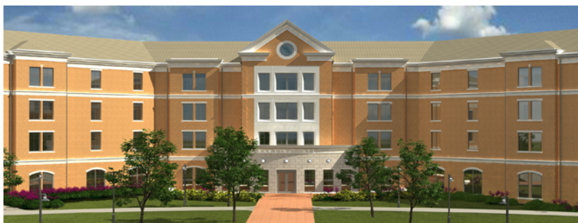
UNT Rawlins Residence Hall , Denton, Texas – 497 Beds, $42M, Pending LEED V. 2009 Gold Certification, Opened Fall 2015