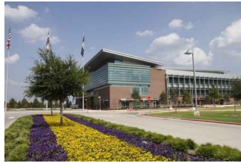
UNT Dallas Founders Hall Academic Building, Dallas, Texas – 101,000 GSF, $43.5M, Received LEED V 2.2 Gold Certification 2011